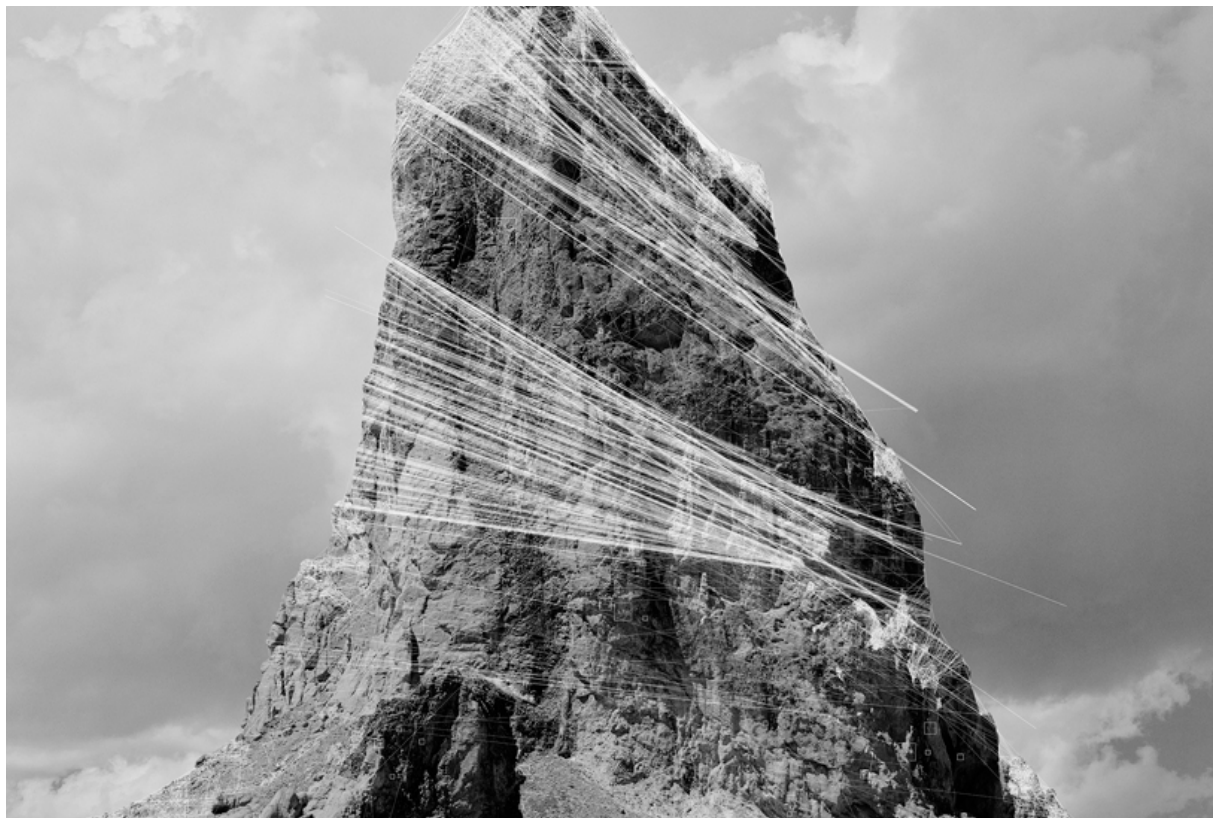
Altman Siegel, San Francisco

ALL IMAGES: COURTESY THE ARTIST AND THEIR GALLERY; ADDITIONAL CREDITS WHERE NOTED