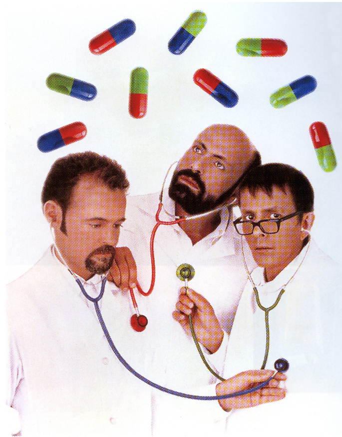
Zurich's MAI 36 Galerie will offer General Idea's Playing Doctor , 1992.

Click the photos below to see works on offer at the fair.