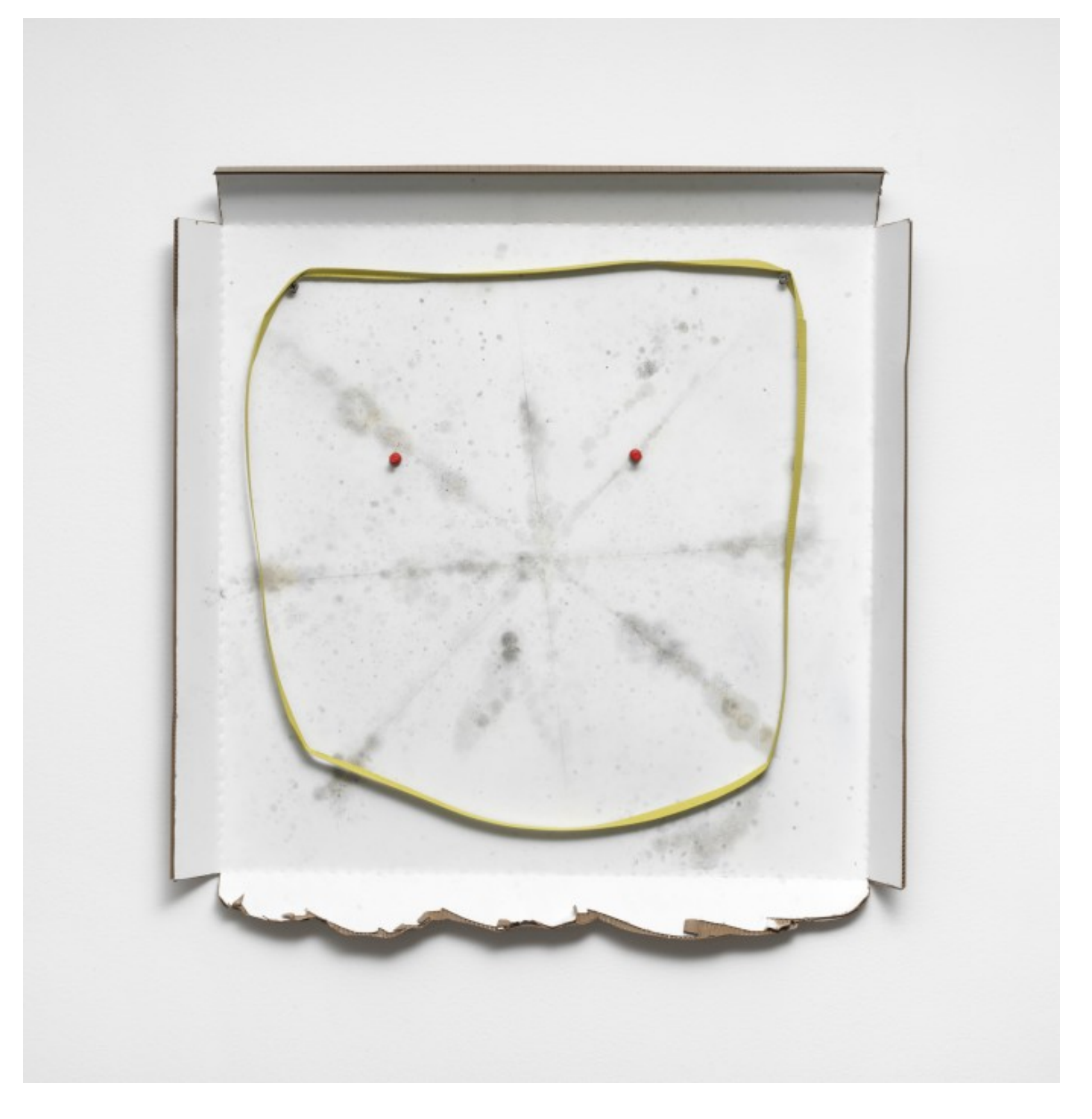
Full gallery of images, press release and link available after the jump. Images: