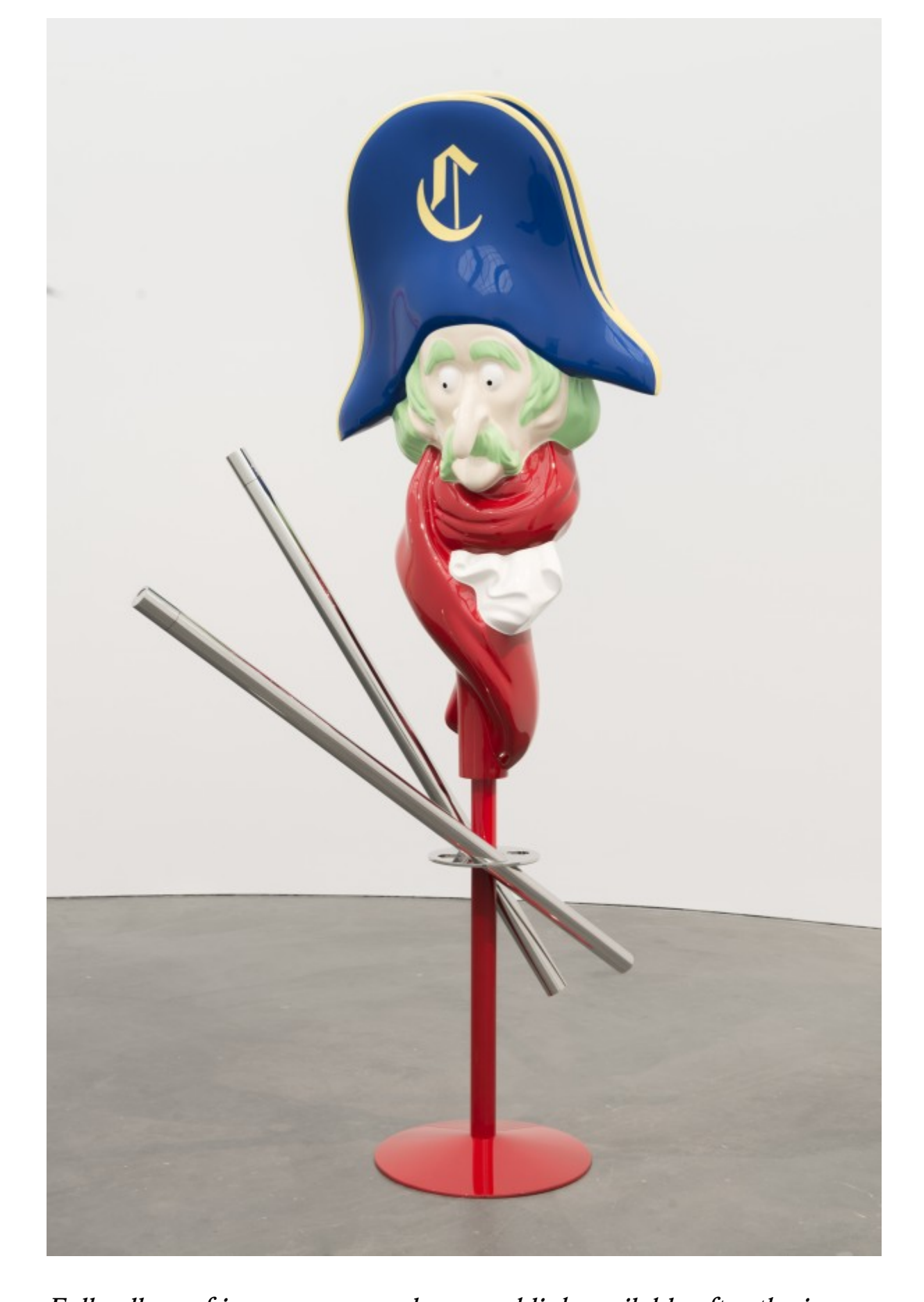
Full gallery of images, press release and link available after the jump. Images: