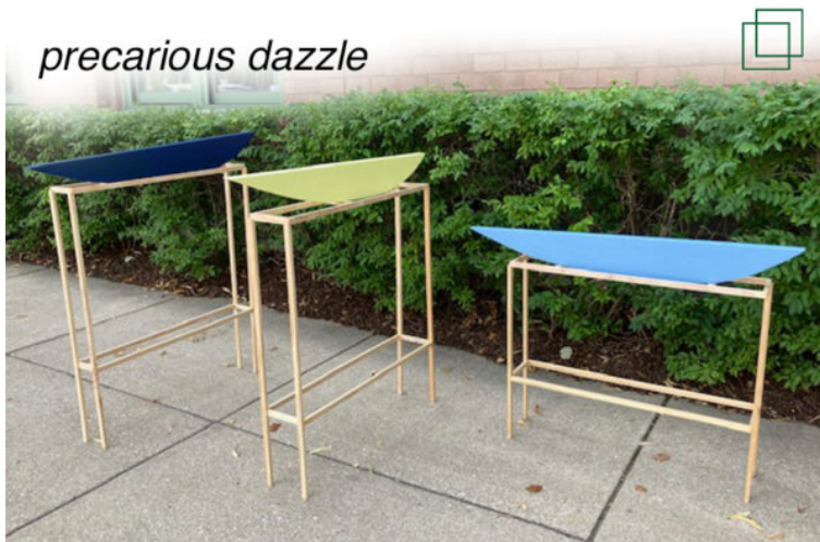
September 12, 1-8pm Produce Model: 1918 S Canalport Ave