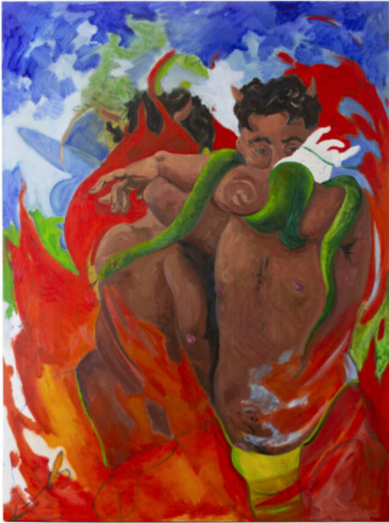
September 12, 1-6pm Julius Caesar Chicago: 3311 W Carroll Ave