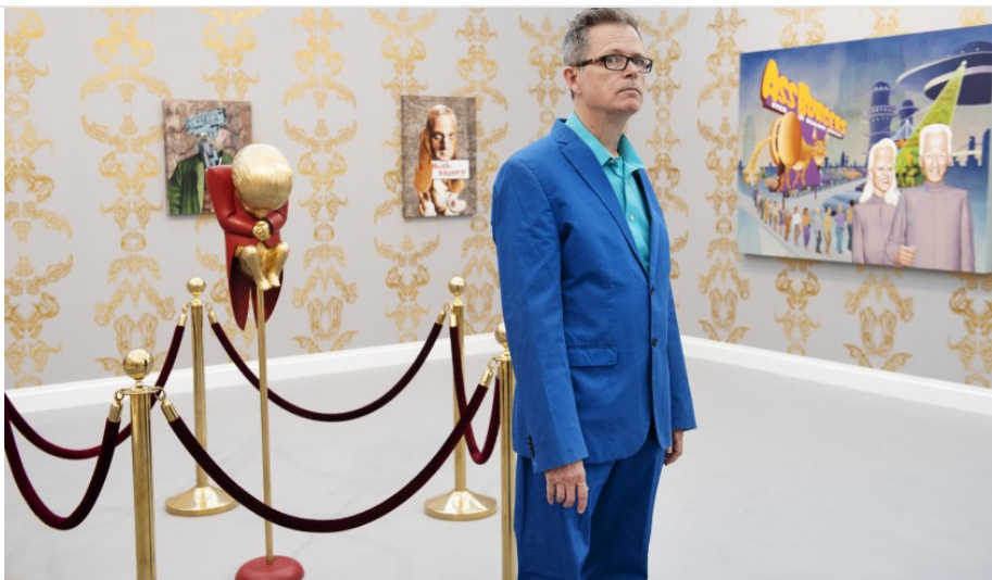
Artist Jim Shaw at his solo presentation with Simon Lee Gallery at Frieze London 2018.