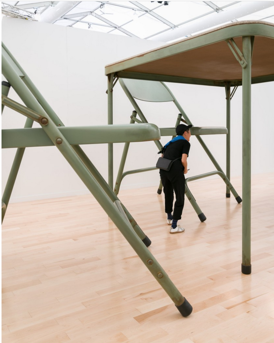
Gagosian gallery at Frieze New York in 2018.