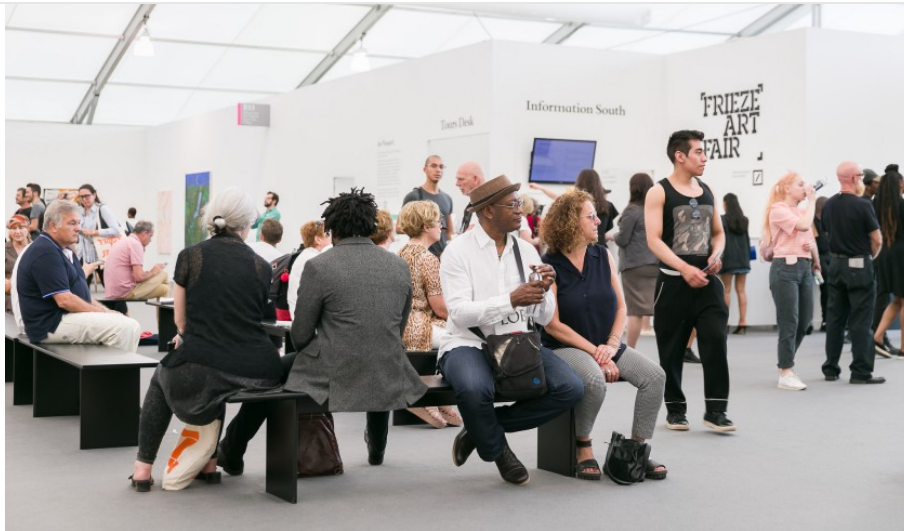
Frieze New York 2018.