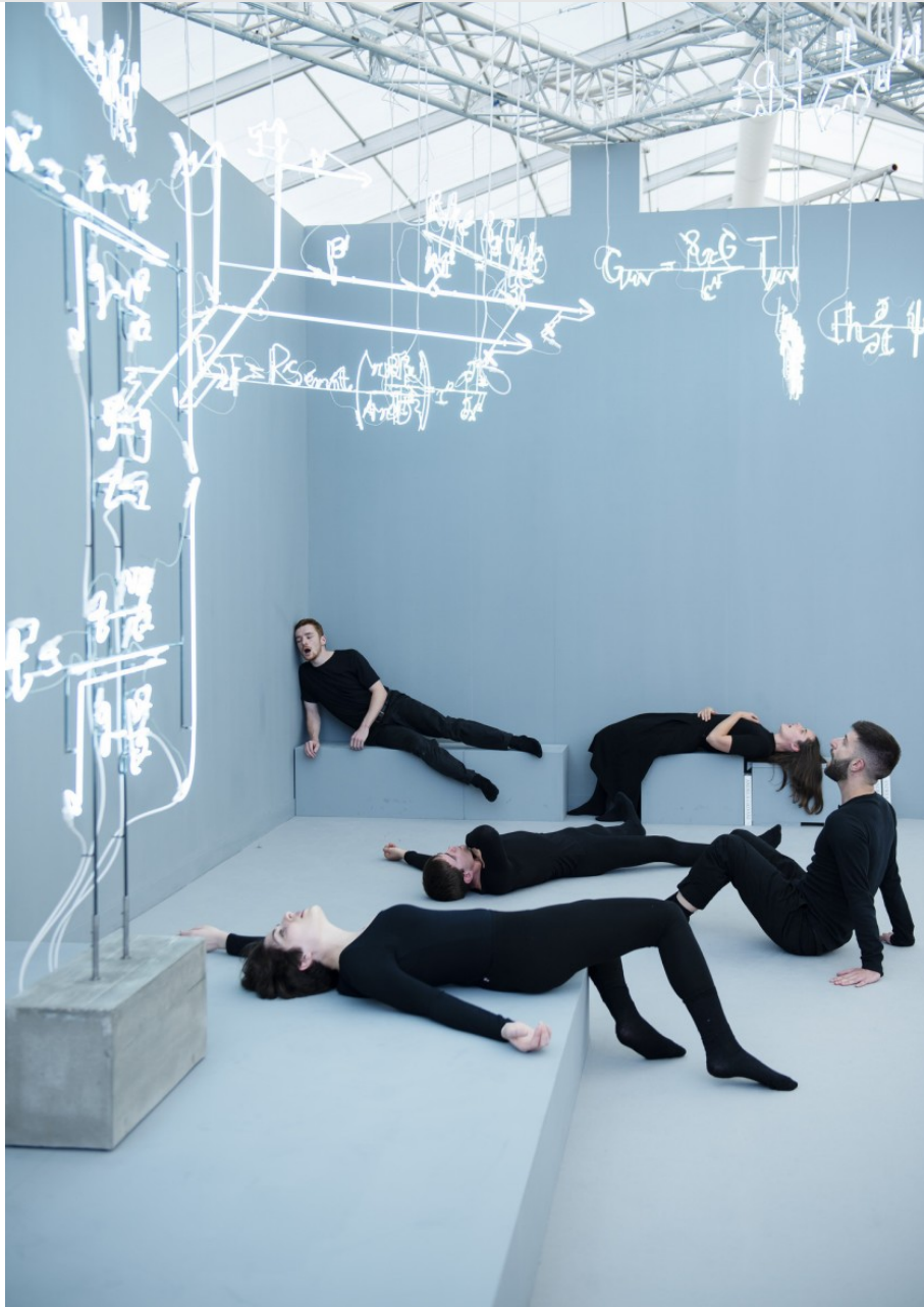
Revolver Galeria in the Focus section of Frieze London in 2018.