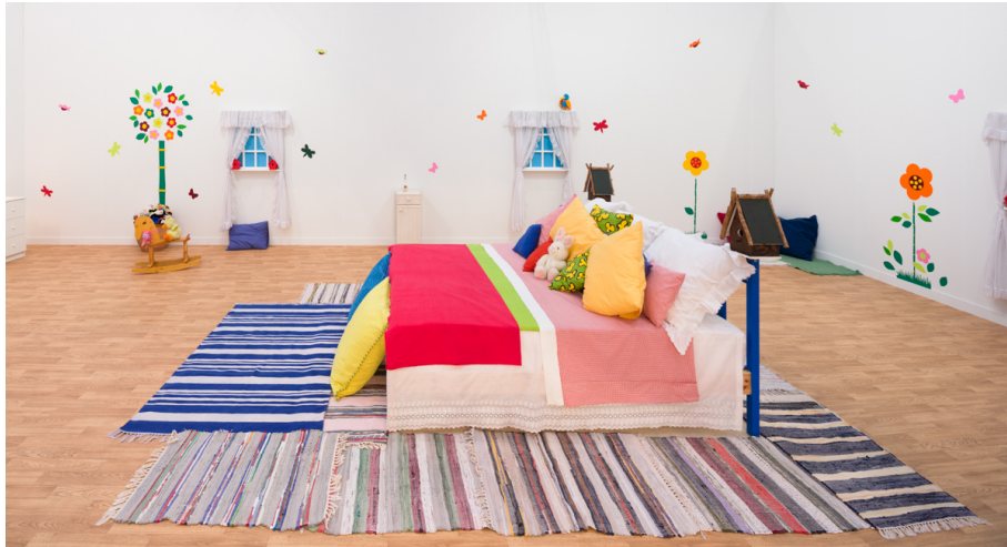
Installation view, Mike Kelly, Unisex Love Nest (1999).