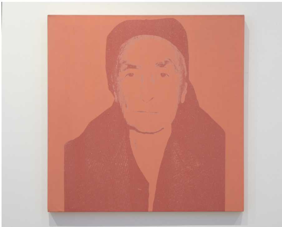
Andy Warhol, Georgia O'Keeffe (1980). The Andy Warhol Foundation for the Visual Arts/ DACs London.

$1.6 million: Yayoi Kusama's Infinity Nets (B-A-Y) (2001) at Lévy Gorvy