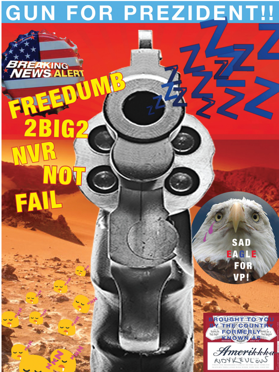
This message has been approved by Ridykeulous (Nicole Eisenman and A.L. Steiner) and W magazine.