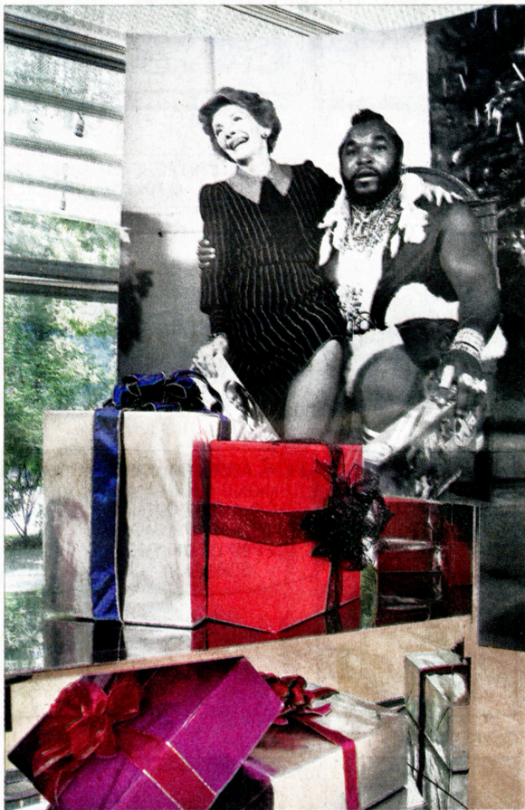
A large black-and-white image of Nancy Reagan sitting in the lap of Mr. T helps amplify the celebrity lunacy that surrounds the presidency.