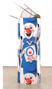
From top: Diana Thater's Delphine , 1999; Kathryn Andrews's Bozo™ The World's Most Famous Clown Bop Bag With Occasional Performance (Blue Variation) , 2014.