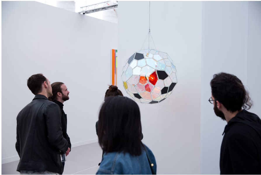
Olafur Eliasson at Tanya Bonakdar Gallery, Los Angeles