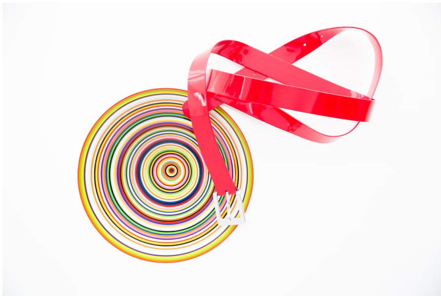
Jim Lambie at The Modern Institute