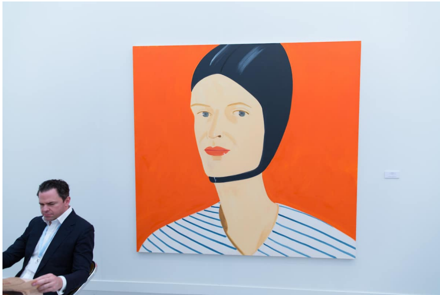
Alex Katz at Galerie Thaddaeus Ropac