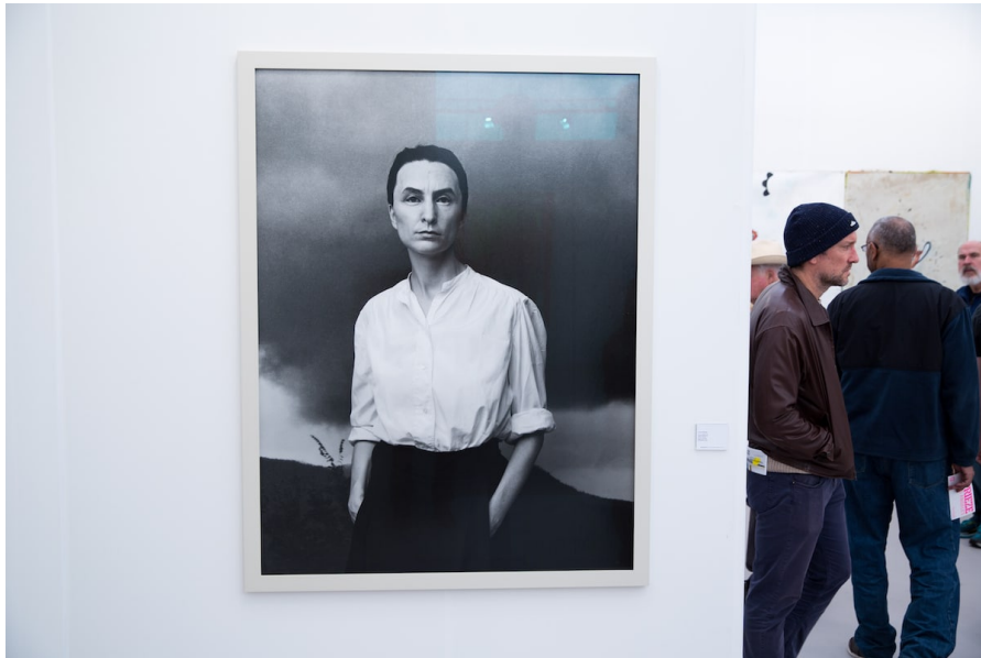
Gillian Wearing at Maureen Paley Gallery