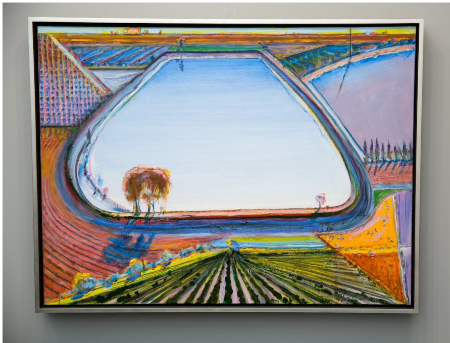
Wayne Thiebaud at Acquavella Galleries Inc.