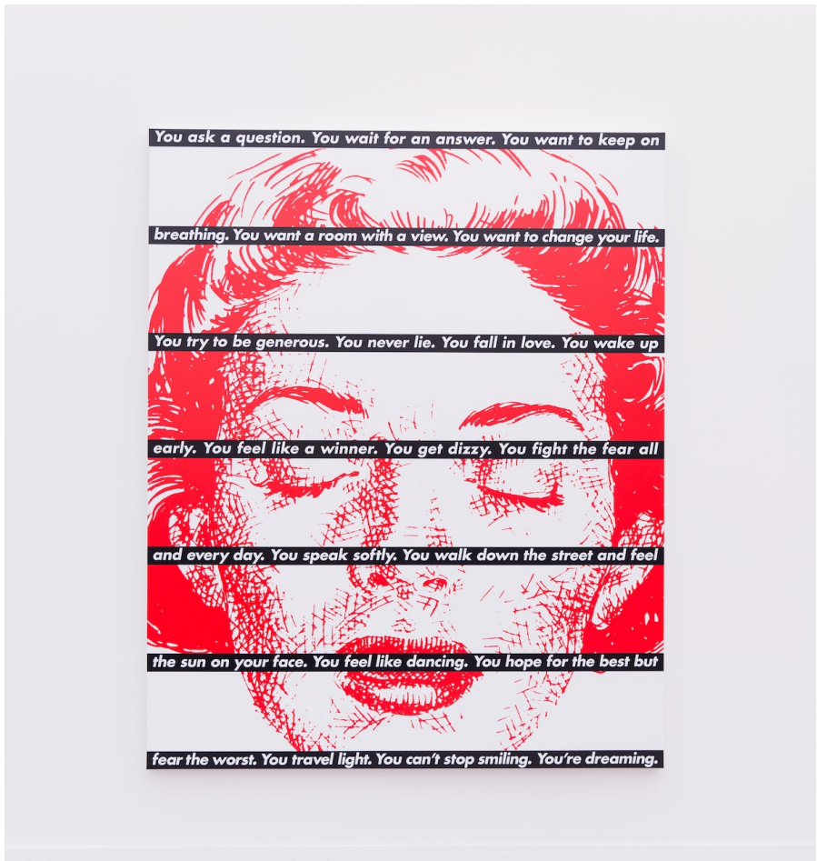
Barbara Kruger at Sprueth Magers Gallery