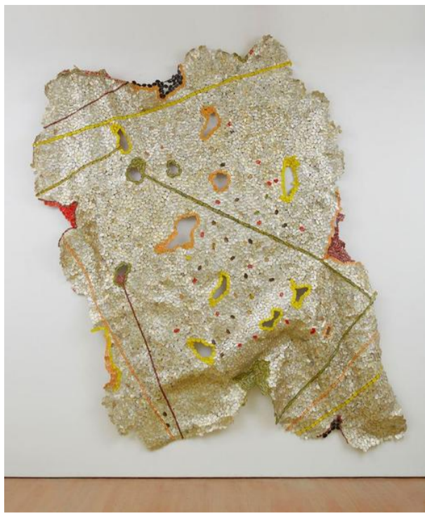
El Anatsui, Topos, 2012, found aluminum and copper wire, 135 x 120 inches