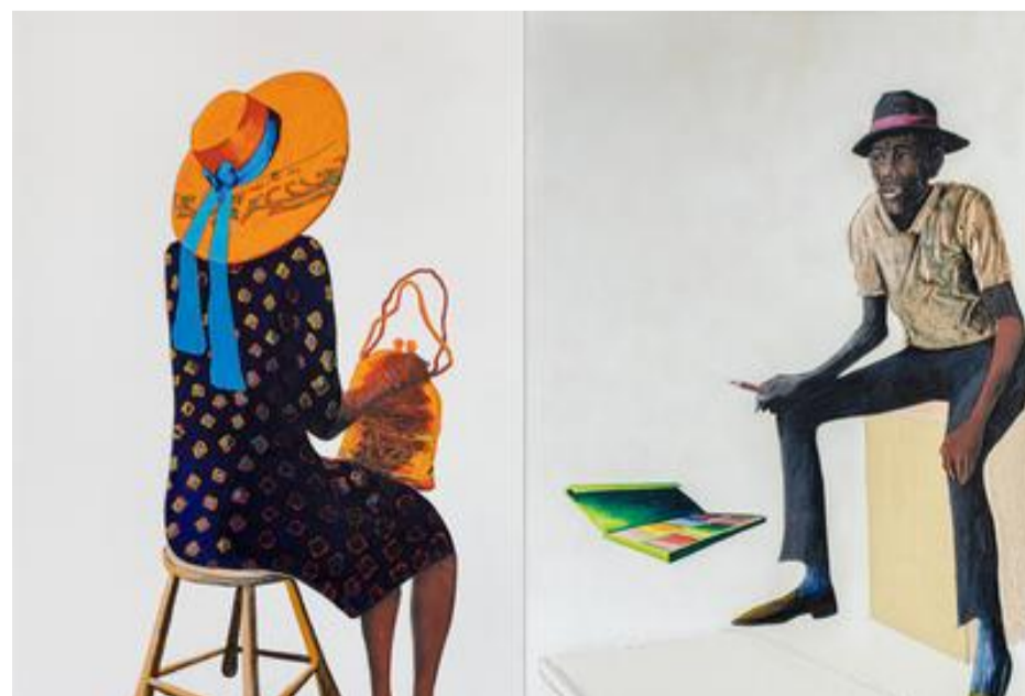
Benny Andrews: Portraits, A Real Person Before the Eyes at Michael Rosenfeld Gallery