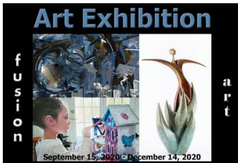
Fusion Art Announces the Winners of the 3rd Annual Women Artists Art Exhibition