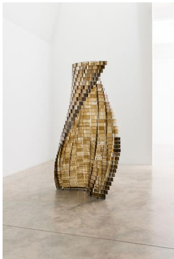
SHIRAZEH HOUSHIARY, Lunate , 2018, glass and polished stainless steel. 51.5 x 26.375 x 12.125 inches.

Frieze Los Angeles debuted as a new international art fair on February 14, 2019 and closed on Sunday, February 17, 2019, celebrating the city's pivotal role in the international art community. The fair attracted 30,000 attendance across the gallery tent and backlot program, including civic leaders, international art collectors, curators, critics, and members of the Hollywood entertainment community. 70 local and international galleries participated, and robust sales were reported from the opening hours of the fair and throughout the weekend. Frieze Los Angeles also built on Frieze's long-standing commitment to curated content, with a non-stop program of immersive artworks, talks and screenings beyond the gallery tent in Paramount Pictures Studios .