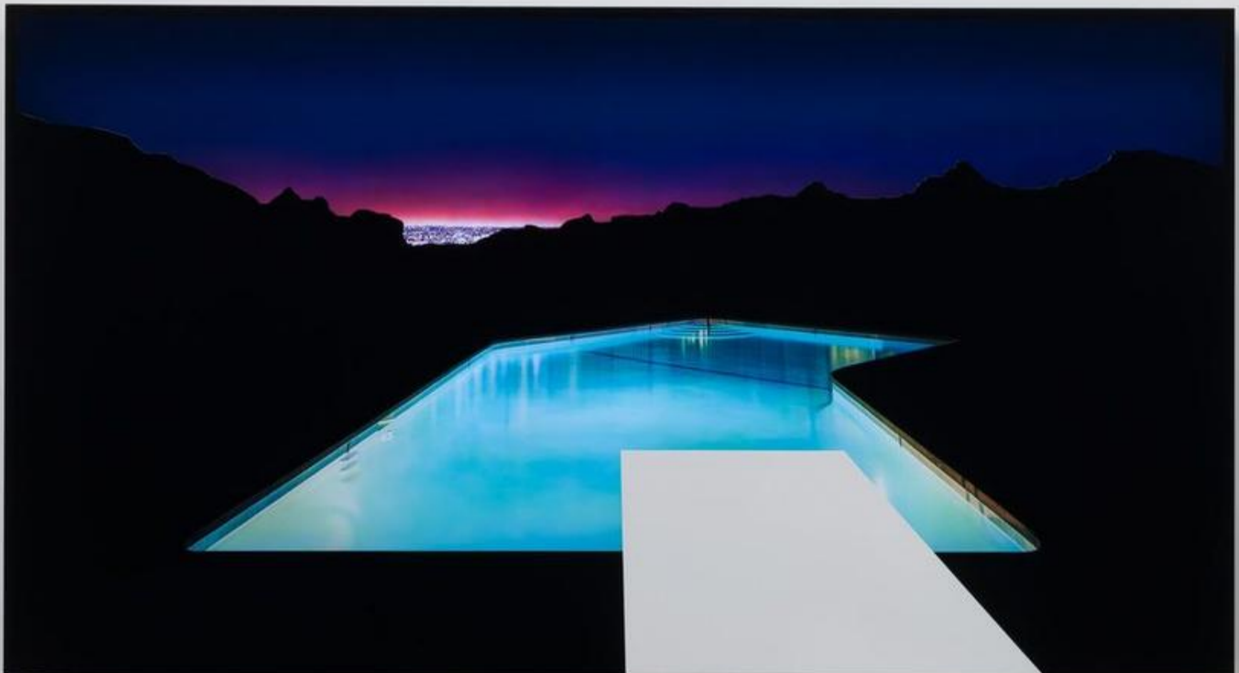
Doug Aitken [Not yet titled] 2018. Chromogenic transparency on acrylic in aluminum lightbox with LEDs. 68 x 125 x 7 inches (172.7 x 317.5 x 17.8 cm) Edition of 4.