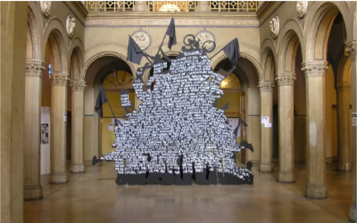
The entrance hall of Bethanien (during Backjumps # 3 in 2007).